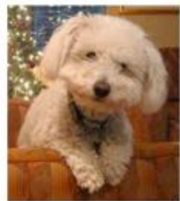
AAG Mascott: Oliver